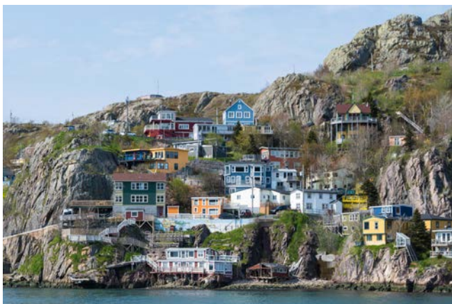
The Battery, St. John's, Newfoundland.