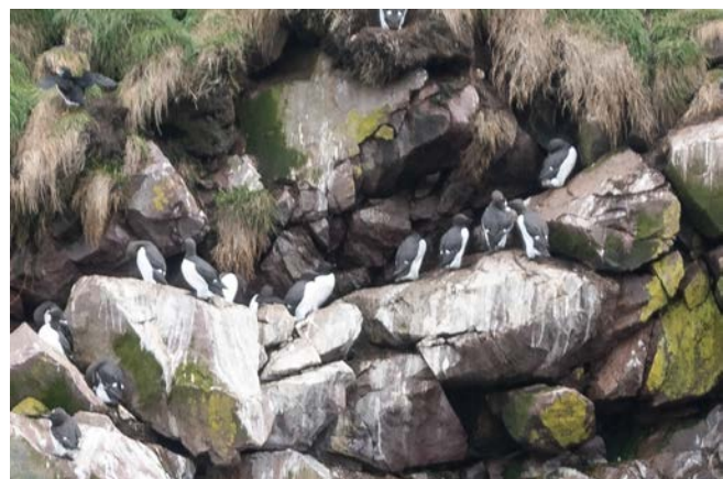
Common Murres.